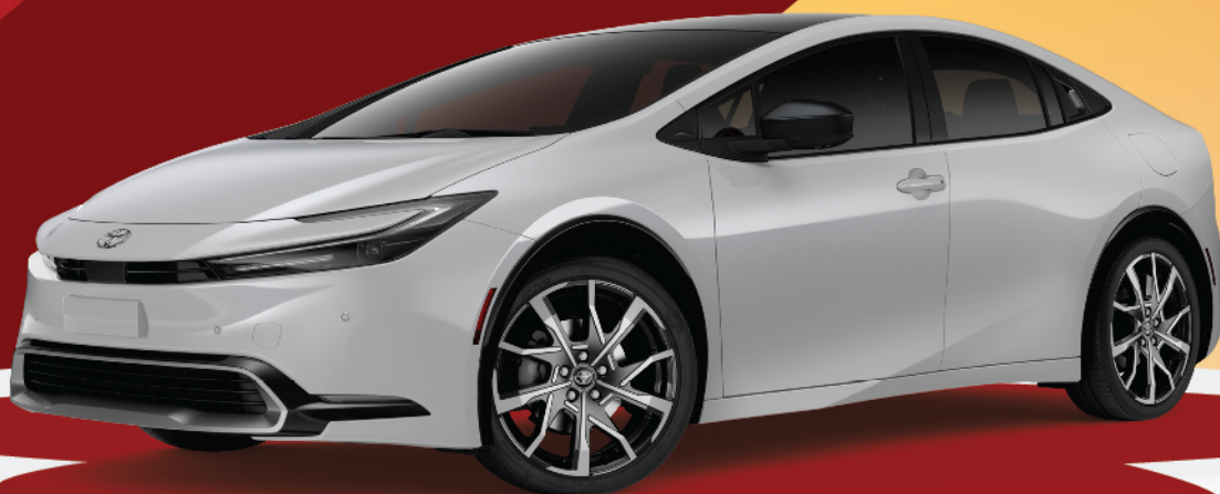
PRIUS PLUG-IN HYBRID XSE PREMIUM